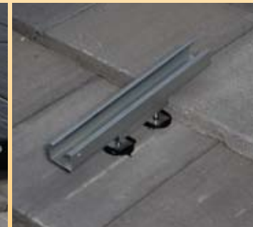
Custom-engineered tile attachment seals penetrations for superior water protection.