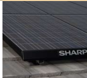
Tapered front covers and hidden hardware create sleek appearance.